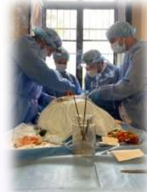
KNOWLEDGE AS RECOGNITION